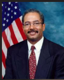
The Honorable Chaka Fattah (D-PA) Member of Congress

ECOSOC Chamber // United Nations // New York