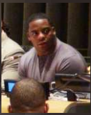
Clinton Portis 2X NFL Pro Bowler, Former NFL Running Back