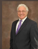
The Honorable James C. Greenwood President and CEO of the Biotechnology Industry Organization (BIO)