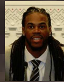
Sidney Rice NFL Pro Bowler, Super Bowl Champion